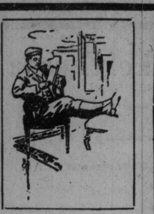
Putting a steple on a house woun't make a church of it; but putting a stylish hat on a man's head goes part way in making him a gentleman. —Dineen.

That's our mission—making men look stylish—and it should be the man's mission to adhere closely to this principle we lay down: be neat and stylish always, and you'll find the "road" easy. Remember, it doesn't cost you any more than being slovenly dressed—just exercise a little taste. We preclude the possibility of your selecting a poor style of a hat by handling nothing but good ones. We are Dunlap's and Heath's sole Canadian agents.