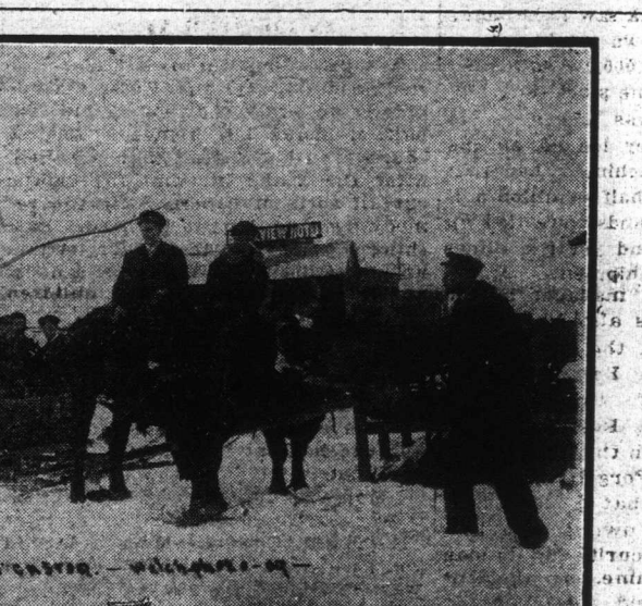
A STREET SCENE IN THE FAST GROWING TOWN OF CASTOR.

ville, Haneyville, Halkirk, Sullivan 600 acres under cultivation. grasses, cabbage, roots and vege-Punch of nearly 5,000 acres. Next Lane & Climie, old-time cattle ranchers, southwest of Castor, are 500 acres under cultivation, are ex-