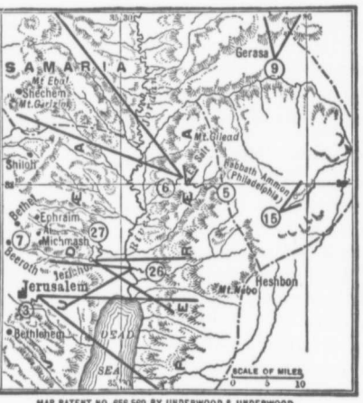
MAP PATENT NO. 656,569 BY UNDERWOOD & UNDERWOOD

It is very probable that Jesus and the disciples, when leaving Perea (off behind us) crossed the river at the bridge here opposite Jericho. The city stood on that distant ter-