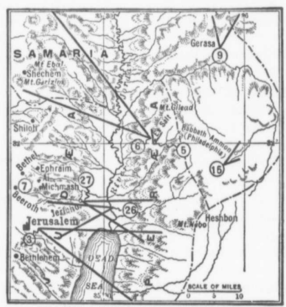
MAP PATENT NO. 656,569 BY UNDERWOOD & UNDERWOOD

artificially shaped into terraces,—level strips of ground, each held in place by a retaining wall of stone, so as to prevent the soil from being washed out of place by the rains.