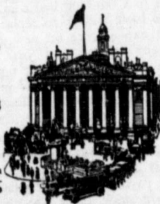
Head Office: Royal Exchange, London

Correspondence invited from responsible gentlemen in un- represented districts re fire and casualty agencies