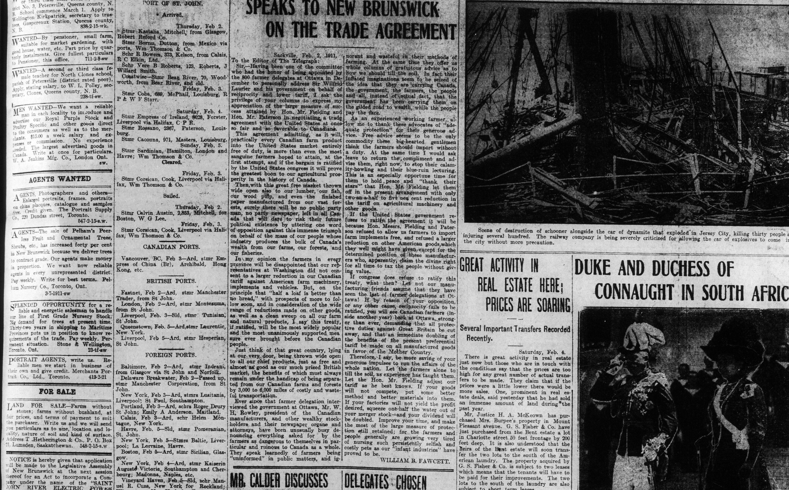
schooner alongside the car of dynamite that exploded in Jersey City, killing thirty people and