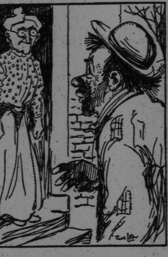
BENEATH HIS DIGNITY.

Centenarian--By perseverance. I just kept on living.