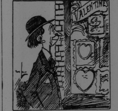
Waste there was a display of valentines. "Why groundhog day, I believe." "What sort of a present will I have to give them?" "A book of poems will fill the bill. Then comes Washington's Birthday."

"It's tough, ain't it?" said the young man who had a farmerish look about him as he turned away from the window of a stationer's, where there was a display of valentines.