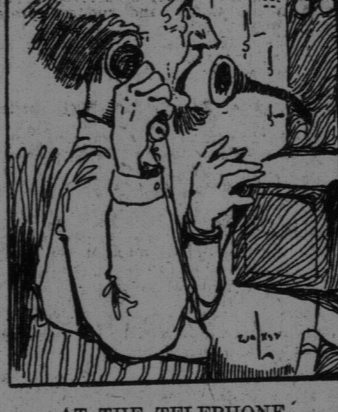
AT THE TELEPHONE.

An old offender that hung on for years. Nothing touched his stony heart but Putnam's Corn Extractor, and out he came root, stem and branch. All corns cured just as quickly when Putnam's is used. Try it.