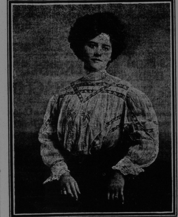
THIS BLOUSE AMONG THE NEWEST MODELS. Hand-embroidered lingerie blouse of the new open-work striped basiste. Cross-wise insets of lace bands in the yoke are crossed diagonally with lace bands, which give the outline of a pointed yoke, and lace trimmed, to match the high standing collar.