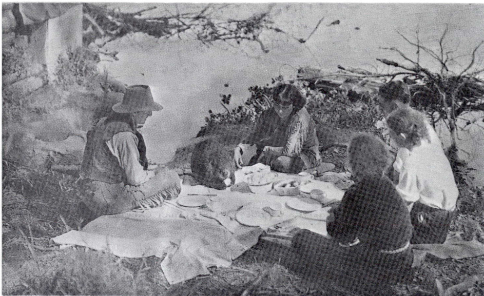
Anahareo and Grey Owl bring their own Jelly Roll to a picnic in Prince Albert National Park, Saskatchewan.

In his four books, Men of the Last Frontier , Pilgrims of the Wild , Tales of an Empty Cabin and Sajo and her Beaver People , Grey Owl weaves a touching and often humorous tale of the antics of the beavers and of his and Anahareo's struggle to protect them. Grey Owl recalled one young beaver, "His whole short life of four months has been turned topsy-turvy, inside out,