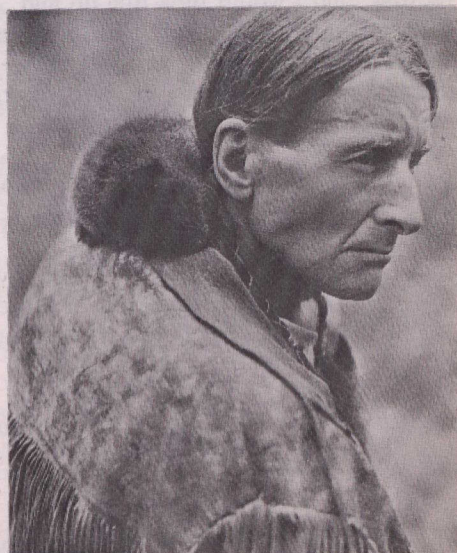
Beaver sleeps on Grey Owl's shoulder.

With the encouragement of his Indian wife, Anahareo, Grey Owl decided to abandon his trapping and devote his energies to saving the beaver from possible extinction by establishing a beaver colony. Two beavers, which