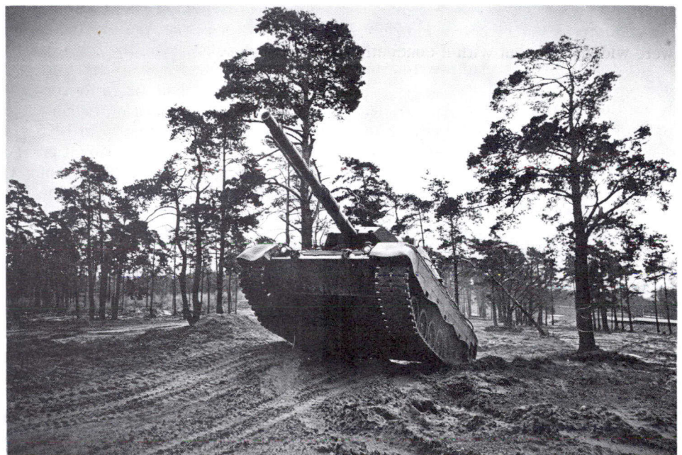
The Leopard's manoeuvrability and speed – 55 mph – are two of the reasons why the Canadians were able to do so well in the competition.