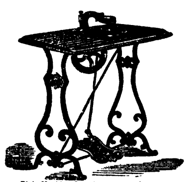
Plain Machine Complete. Price $25.00.