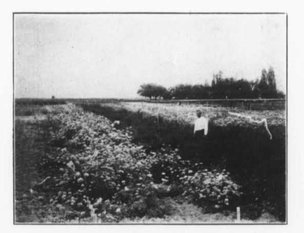
Carrots and Beets Grown for Seed at Horticultural Experimental Station, Vineland, Ont.

Roots may be kept in ventilated pits or root cellars, but onions re-