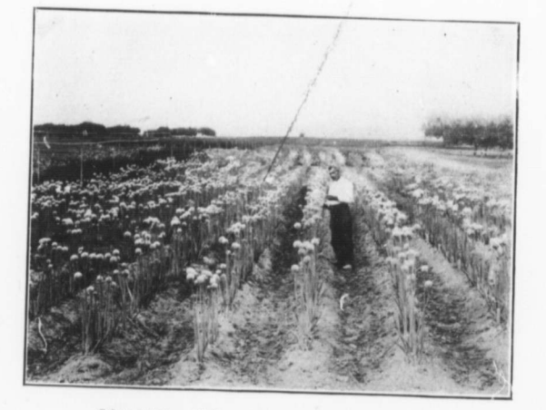
Selected Onions (Yellow Globe Danvers) Grown for Seed.

mercially. The highest percentage of germination for mangel seeds obtained at eight different sources was obtained from College-grown seed (average of three years). The highest yield of mangels obtained in experimental work at the College was from seed of their own production. Little experimental work has been done in the past on seed growing of the various vegetables, but yields and results that have been obtained from field roots and beets should be very