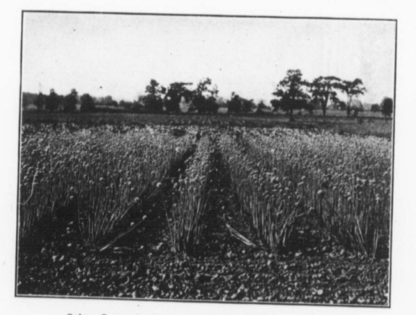
Onions Grown for Seed on Herold Farm, Beamsville, Ont.

Beet and carrot stalks may be hung up to dry or special frames made and the stalks piled on these. Whin dry, they are drawn in on a canvas-covered wagon rack and threshed on a canvas with a flail or with a special threshing machine if a large amount is grown. Premature frost is one of the hazards in seed