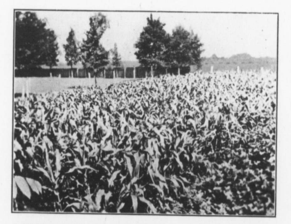
A Plot of Corn in School Garden at Marden, Ont.. Riddle-Find the Teacher.

industry must not be over done, and it requires continuous selection to maintain even our present standards of type and quality.