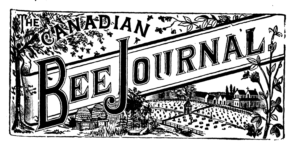
" The Greatest Possible Good to the Greatest Possible Number."