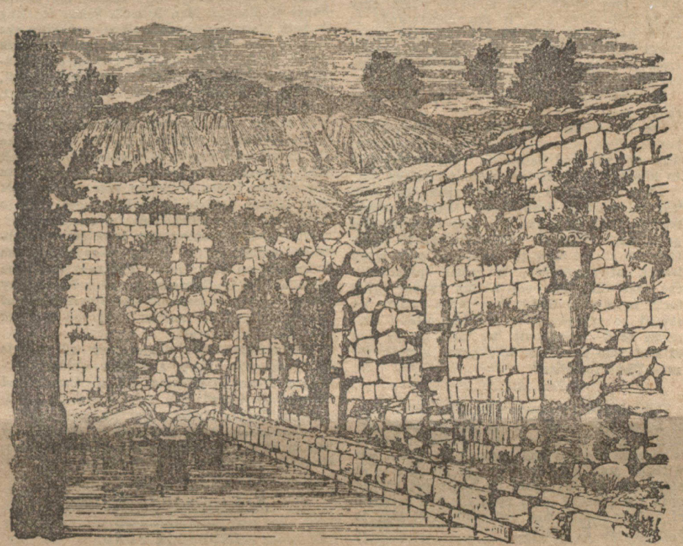
THE POOL OF SILOAM, OUTSIDE JERUSALEM.

The spring rises and overflows four times a day. Early in the morning, as soon as the day breaks, large numbers of men gather, fill