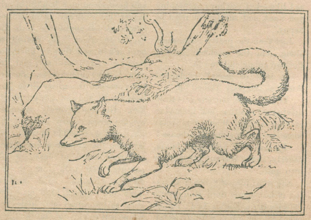
ASK MOTHER WHAT THE BIBLE SAYS ABOUT FOXES?

The sunshine of life is made up persisting will chafe and fret others; of very little beams, that are bright to take an ill word or a cross look all the time. In the nursery, in rather than resent or return itthe playground, and in the school- these are the ways in which clouds