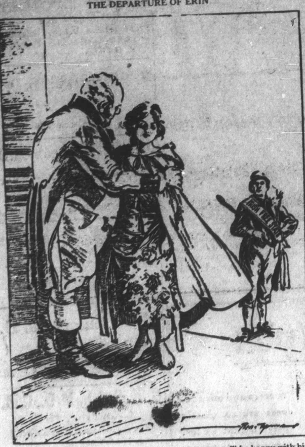
John Bull (to Erin) Well, good-bye Erin: and I hope you'll be happy with him. -From London Opinion.