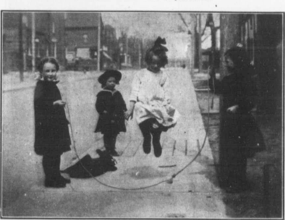
ONE SURE SIGN OF SPRING.

3. Arrange for a series of home social evenings and strengthen and make more interesting the play and recreation of every home in the community so far as this be practicable.