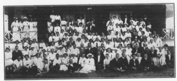
THE HAMILTON CONFERENCE SUMMER SCHOOL, 1914.

And furthermore, in the third department of our League-Literary and Social constructive culture may be attained. This department affords an opportunity for work that is thoroughly warranted by the prevailing spirit and genius of our day. The world is going to school; education is being sought everywhere; ideas rule the world; wider knowledge means clearer vision, and it is regarded as being well-nigh a crime for any young person to remain ignorant. The wise man of old said, "Where there is no vision the people perish." And how can vision be widened and heightened unless through all-round physical, mental, social and religious culture? Though the time for a thorough working of the third department is very inadequate, if those in charge will plan far enough ahead, much can be accomplished. Of course it can-