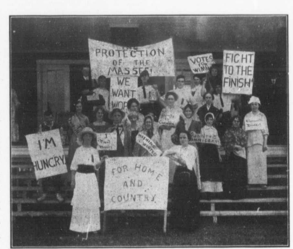
"THE CITY PROBLEM" STUDY CLASS, HAMILTON CONFERENCE SUMMER SCHOOL, 1914. See announcement on p. 95.

The Missionary Education Movement is made up of representatives from these