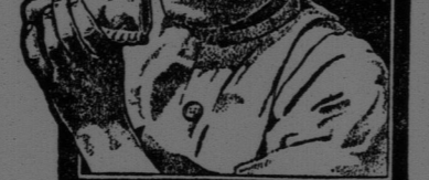
"Good Old Mince Pie Like Mother Used to Make"

If you really want your old-time boy appetite to return to you once more, from the practice of eating a Stuart's Dyspepsia Tablet after each meal. Results will astound you.