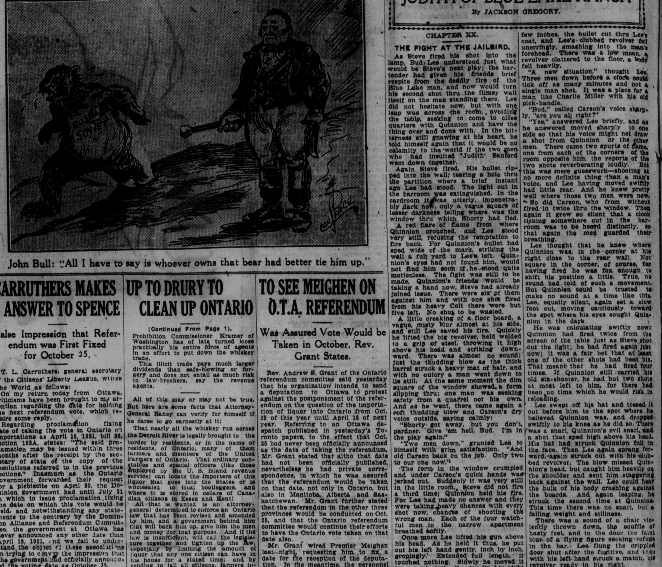
John Bull: "All I have to say is whoever owns that bear had better tie him up."