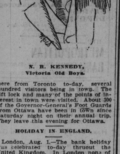
N. R. KENNEDY, Victoria Old Boys.

HAMILTON, AUG. 1.—(Special)—The radial car that left the station at 6.10 for the beach this evening jumped the track at the corner of Wilson and Wentworth-street and broke a big electric light pole. The passengers were shaken up, and many or less bruised, but no one was seriously injured, although one man was shot out of the car on to the boulevard. Traffic was blocked for over an hour. The railway officials made an investigation and found that some one had placed a block of wood on the track at the corner of Wilson and Wentworth-street.