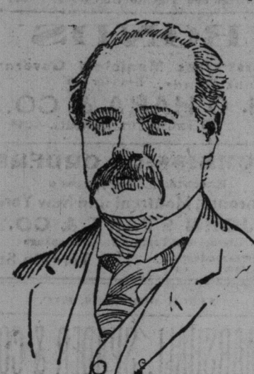
Victoria Old Boys

Lindsay, Aug. 1.—(Special.)—Lindsay to-day suffered an invasion to which it joyfully surrendered in the shape of the Victoria County Old Boys' Association of Toronto. Great indeed must have been the expectations of the visitors if they were not fully rea personal, acorded them to-day. The town was in gaia attire for the reception, and welcome was not more plainly spelled on banner and address than it was in the faces and deport