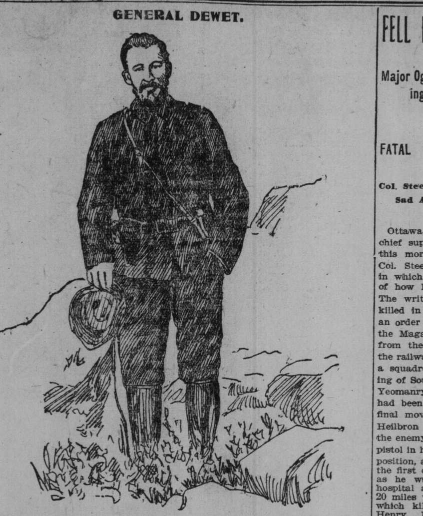
To capture whom every energy of the British soldiers in South Africa is being put forth.