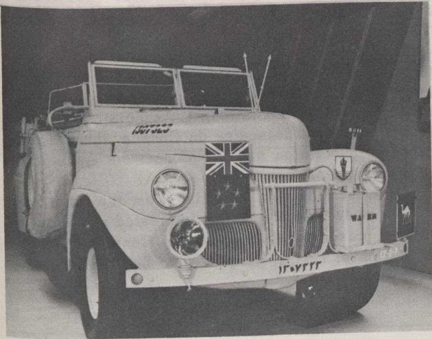
National Museums of Canada

Alexander's car, driven a total of 180,000 miles, wore out four engines.