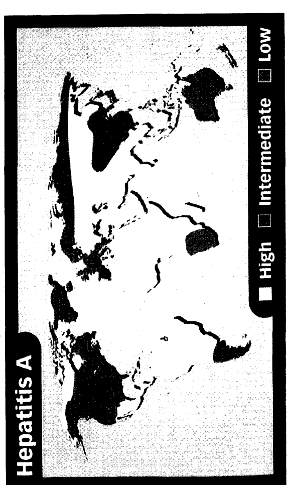
Relative Endemicity Rates