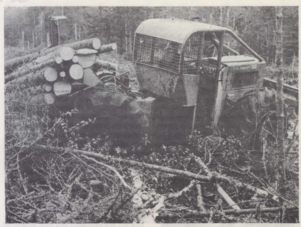
A "skidder" plows through heavy underbrush with a pile of eight-foot logs.