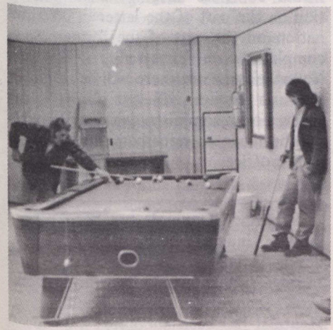
Recent arrivals shoot pool in the trailer.

The institution insists that inmates develop good work habits and skills. Every-