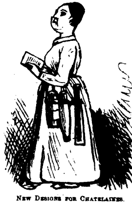
NEW DESIGNS FOR CHATELAINES. For a Domesticated Lady—pepper-box, rolling-pin, chopper, etc.