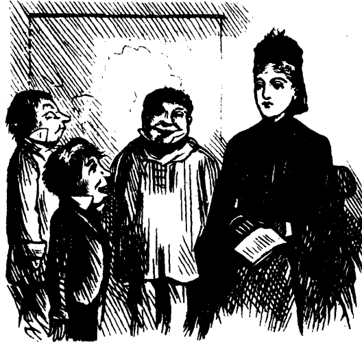
RATHER HARD ON THE HAMS. Rising Scholar (parading the word Bird). Bird—a noun—singular number, masculine gender. Lady Visitor. Stop—stop! How masculine! It is common as to gender. Rising Scholar. Yah! bah! Who ever heard owt of a hen a-singin'. Yah! bah! (Confusion of Lady Visitor).