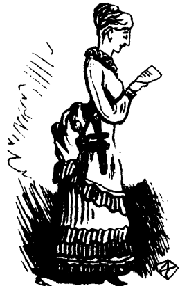
NEW DESIGNS FOR CHATELAINES. For a Young Lady with Many Lovers—pistol, dagger, etc.