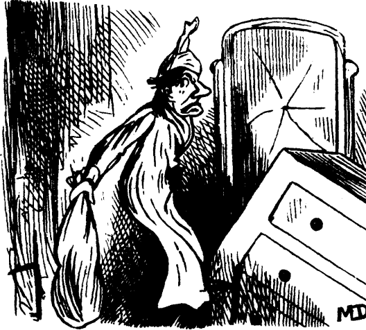
Twenty Minutes After (by the same Author).