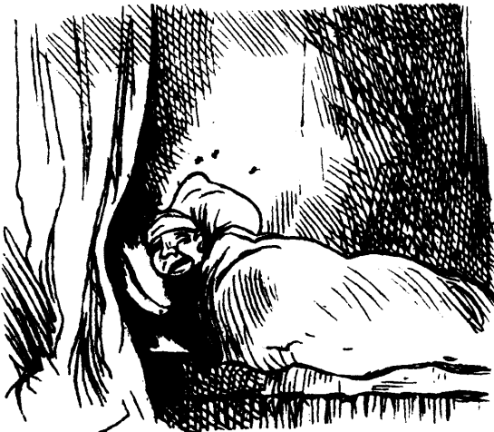
The Three Mosquitoes (not by the Great ALEXANDRE)