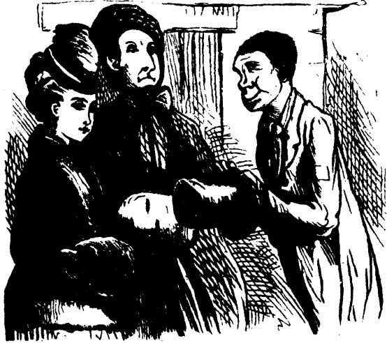
THE ADVANTAGES OF KEEPING GOOD COMPANY. Elder Lady. Oh, PAT, PAT, where do you expect to go to when you die? Pat (who has just come out of prison). Faith, Miss, an' I expects to go to Heaven, an' so please. Lady. How ever can you expect that? Pat. Sure, Miss, an' it's because I've conversed with angels.