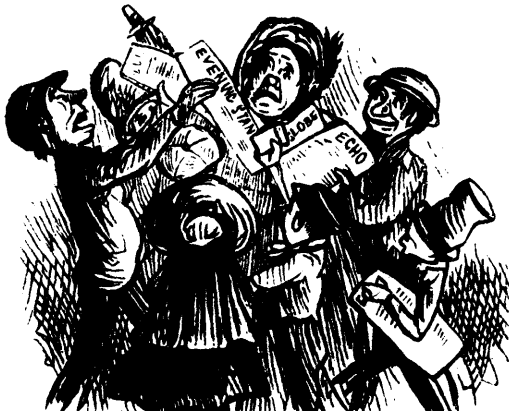
AN EVERY-DAY OCCURRENCE. A Voice from the Crowd. Drabbit the boys and girls, I don't want no Heckies, nor Globes, nor fuseses, I was only a-footin' for poohy-hankercher.