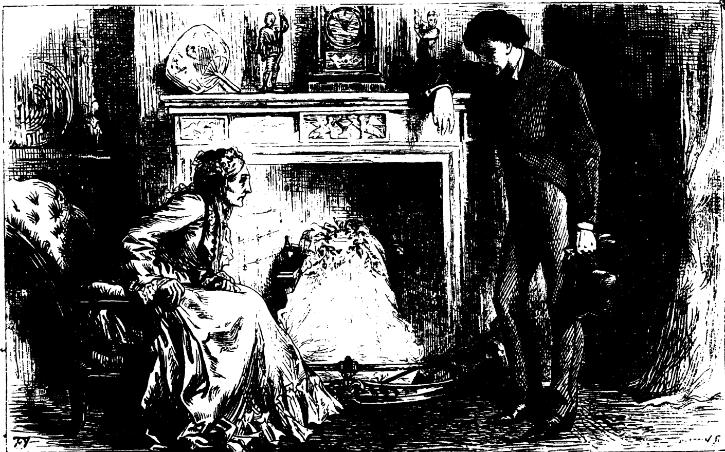
"DO YOU INTEND TO MARRY HER?" DEMANDS THE MOTHER FIXELY. HIS EYES DROOP; SILENCE IS HIS ONLY ANSWER.