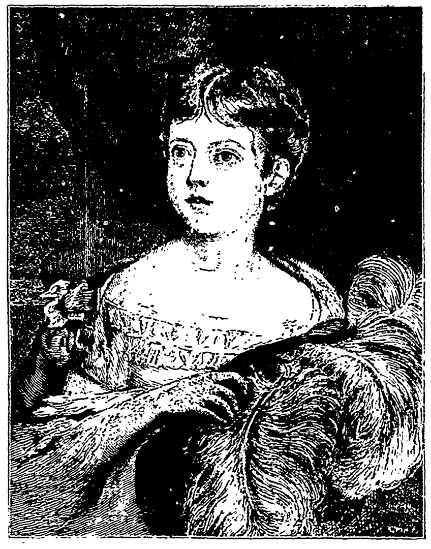
THE PRINCESS VICTORIA AT THE AGE OF TEN YEARS.