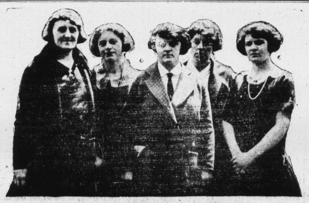
DOMINION OF CANADA FIRST AID CHAMPIONS

Building Contractors Woodworking Shop Next Door Mitchell's Meat Market