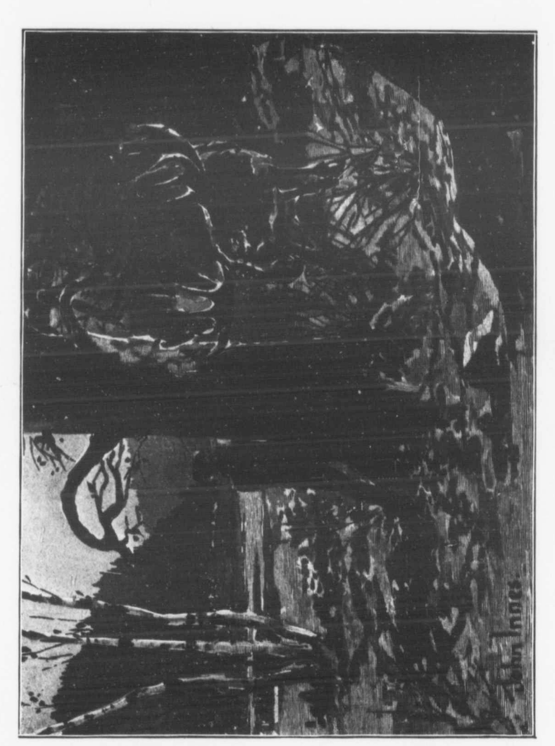
"I remained behind the tree, dodging round."-p.189.

b ti fo as A hi a m m jus tea an wa tre furi utte whi upo six Whi tree, the