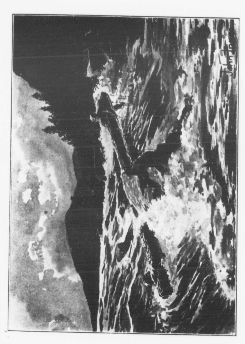
"When Martin came up I went down."-p. 92.