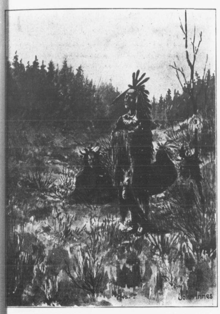
"He stood there, a colossal statue in bronze."-p. 12.

d the stem o as not to ned to his nim. The the stem. ded to put