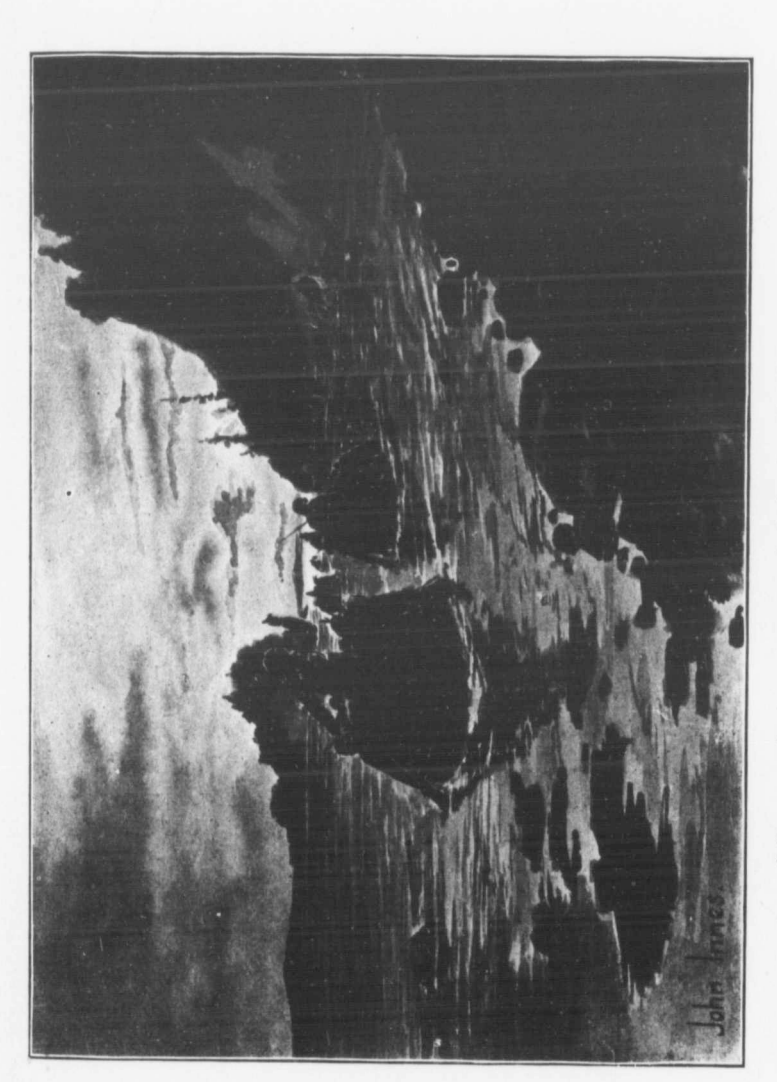
"Soon twelve canoes rounded the headland."-p. 54.