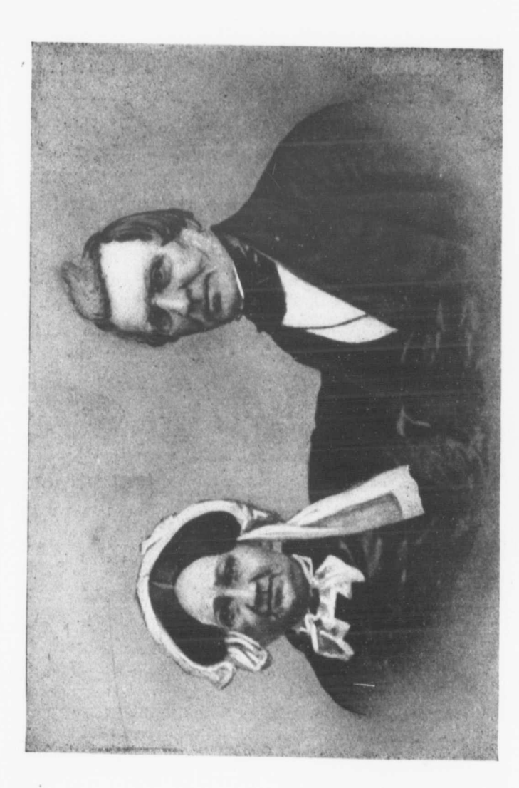
HON. LOUIS JOSEPH PAPINEAU AND MADAME PAPINEAU.

From Morgan's "Types of Canadian Women" (copyright, 1903), by permission.