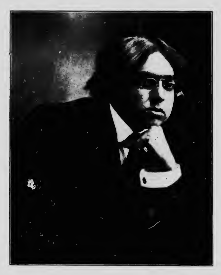
Yours for India, Saint N. Sing