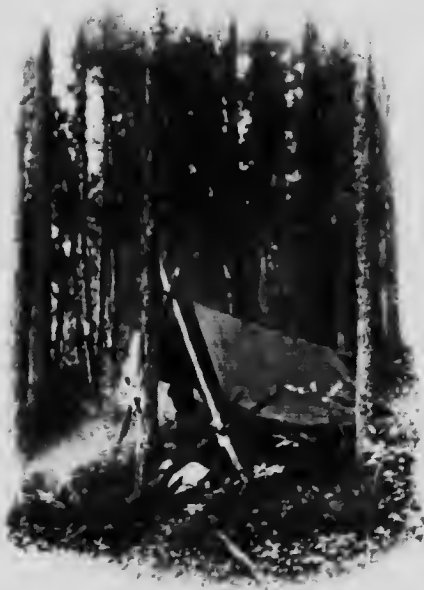
ROUGHING IT A WET MORNING

Corn Mush —Place over the fire about a gallon and one-half of water in a pot to boil, with about two tablespoons of salt. Then stir about two quarts of meal in two quarts of cold water. When the water in the pot is boiling pour the