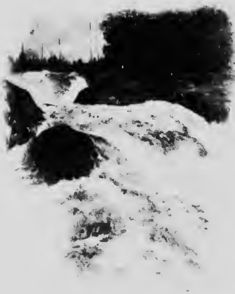
KIPAWA RIVER FALLS.

REACHED BY THE Canadian Pacific Railway VIA MATTAWA, ONTARIO