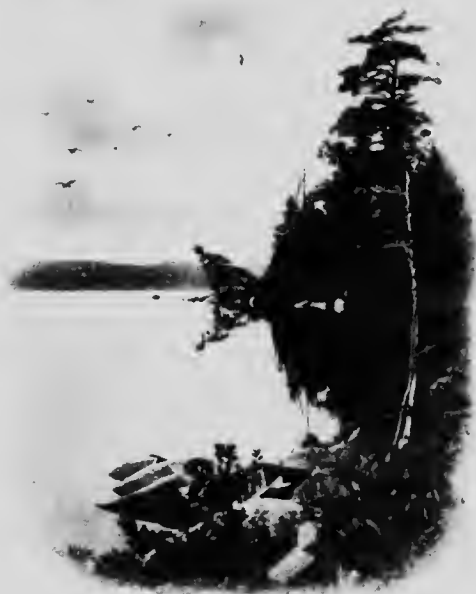
ON LAKE TIMAGAMING