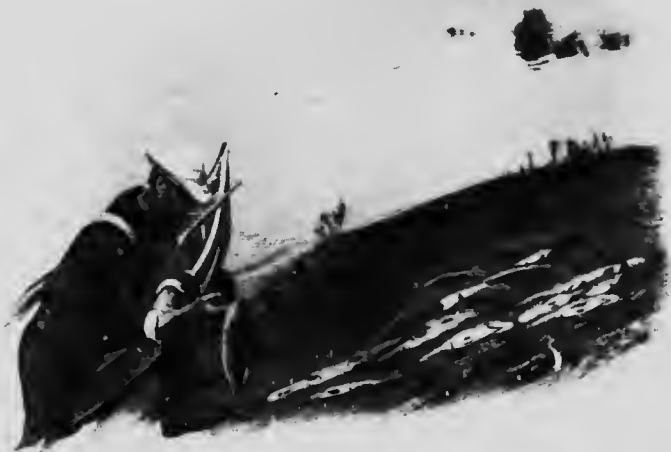
A MORNING'S CATCH.