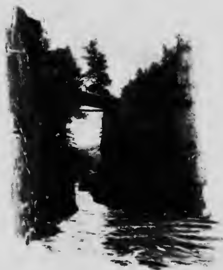
THE NOTCH, MONTREAL RIVER.