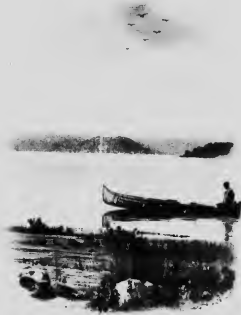
DIAMOND LAKE, TIMAGAMING