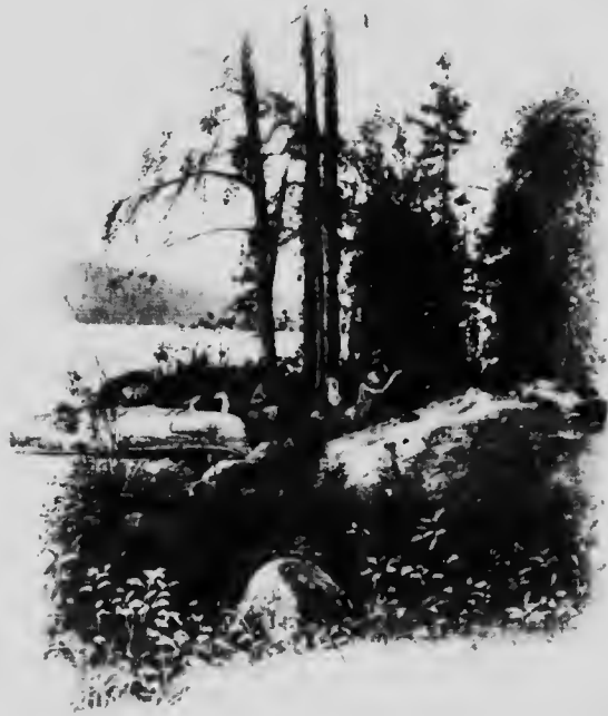
RABBIT LAKE, ON METABETCHEWAN RIVER, ONTARIO.

Alcohol in any of its forms and water in equal proportions will make a good preservative. Soak the fish, wrap in cotton, and keep moist.