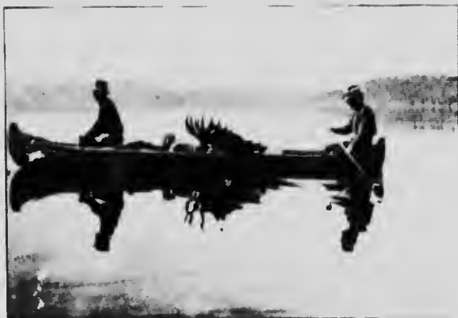
BRINGING OUT THE MOOSE HEAD.