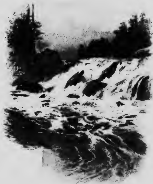
FIRST FALLS ON GREY'S RIVER (MENJAMAGOSIPI)

Birds and Meat, to Bake —Pluck and draw the birds from the vent, wash them clean, make a stuffing of bread crusts, crackers, or what you have in that line, chop up one or two onions fine, pepper and salt; the giblets boiled and chopped fine might also be added. Moisten with water and cram the birds full. Salt them and place them, back down, in the baking pot and put a little water in. Baste the bird with the hot water. It will take an hour for partridges, etc., of the same size; larger, longer in proportion to size.