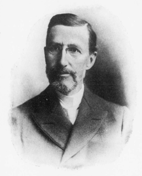
SYLVANUS STALL, D.D.