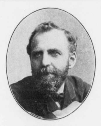
WILLIAM T. STEAD

COMMENDED BY WILLIAM T. STEAD The Eminent English Editor and Author