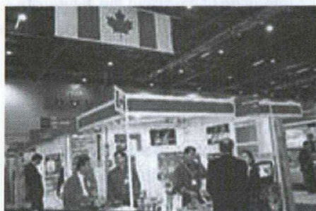
Canada's stand at this year's show.

As in previous years, the Canadian High Commission is also pleased to support Canadian exhibitors by offering the following additional free services: