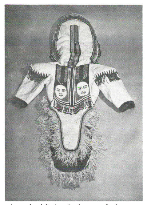
trimmed with Arctic fox, made in Spence Bay, Northwest Territories, (above) an "attigi", a reverse caribouskin parka worn beneath a second caribou parka, from Baker Lake, NWT,