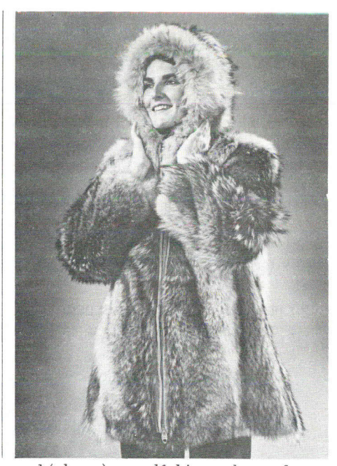
and (above) a wolfskin parka made at Aklavik, NWT. The exhibit is sponsored by the Canadian Eskimo Arts Council, advisers to the Northern Affairs Department.