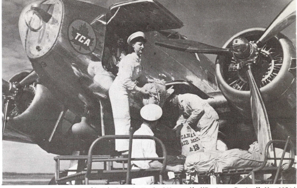
(Article from the Bank of Montreal's "Business Review", May 1974.)

Loading the mail at Dorval Airport, Montreal - 1944.