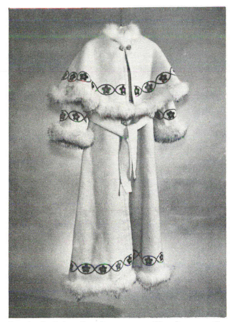
Included in the items on display at the exhibition "Crafts from Arctic Canada", at the Toronto-Dominion Centre Observation Gallery from June 19 to August 15 are (above) a coat and cape