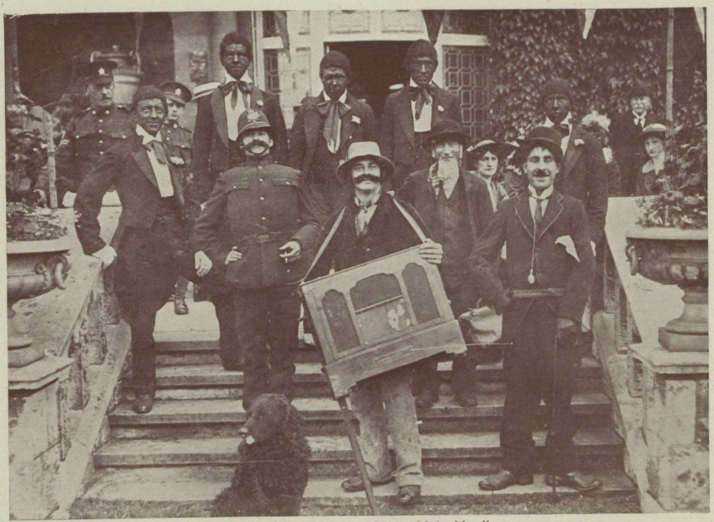
Some of the Dominion Day "Make-Ups."