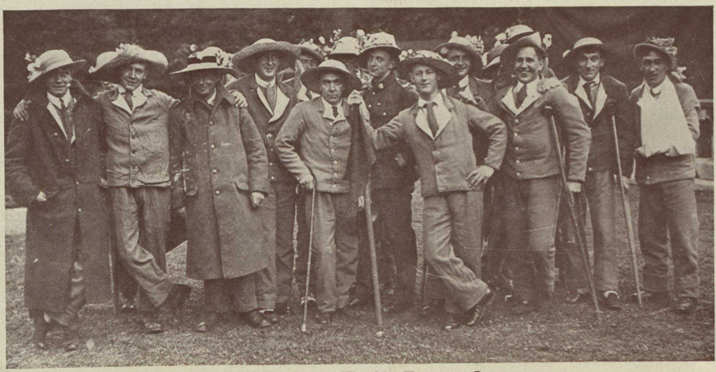
Dominion Day Fete.—The Hat-Trimming Contest.

The same afternoon also, there was a great baseball match at Lord's Cricket Ground, between two teams of Canadian soldiers now in