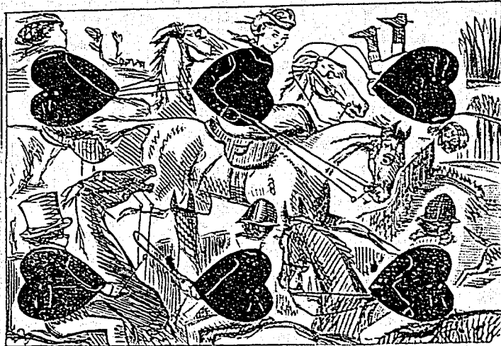
CARD ILLUSTRATIONS—No. II.