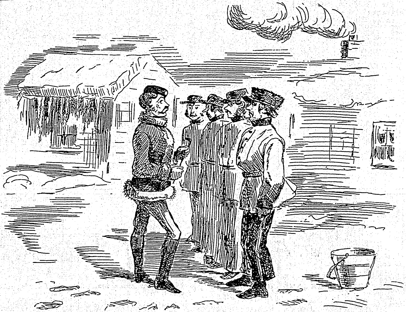
OUR EMBRYO SOLDIERY.

ADJUTANT (of the Regulars) TO MILITARY SCHOOL CADET:—"Don't you know that you are not allowed to come on parade in this state? You must shave, Sir, - - - unless you are growing a beard." CADET (immensely relieved):—"Oh! I've been growing a beard for the last fortnight, Sir!"