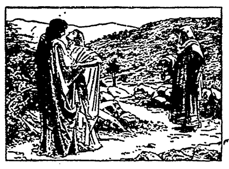
RUTH AND NAOMI

II. COMING TO BETH-LEHEM.-19-22. All the city was moved. Bethlehem was a village, and, like villages to-day, was interested in strangers. Is this Naomi? It is easy tocomebacktoyour native place prosperous. but hard to come back