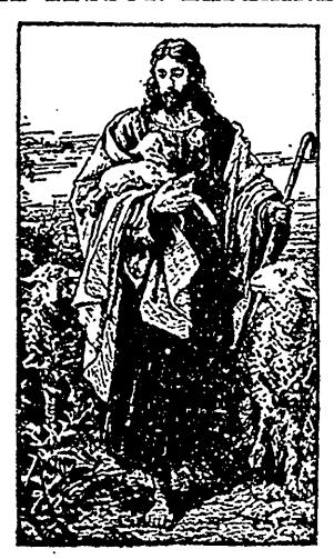
THE GOOD SHEPHERD

II. God is a Guide.—3b, 4. In the paths of rightcourness. There are many possible ways in life. But God leads in the ways of holiness. There are no green pastures and still waters in any other way. God's care is holy. Through the valley. The sheep need more than guidance. They need protection. They are exposed to danger from robbers and wild beasts when they pass through dark ravines. The Christian has valleys where he meets Apollyon before whom he