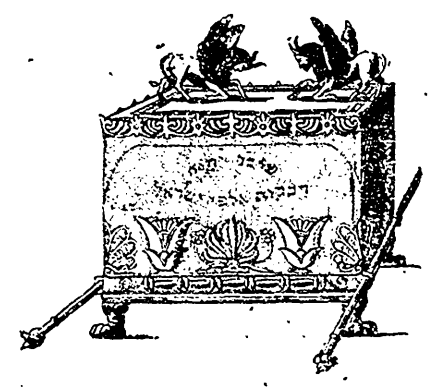
THE ARK OF THE COVENANT

6-8. What meanth the noise. . Wee unto us. The Philistines were at first perplexed, and then