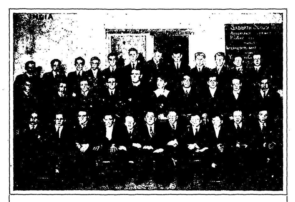
St. Andrew's Club, Knox Church, Goderich, Ont.