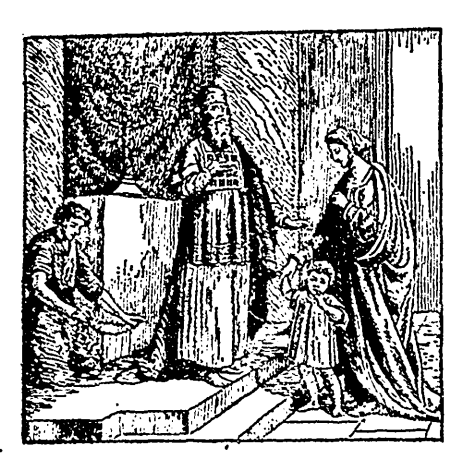
THE DEDICATION OF SAMUEL

I. THE CHILD IN THE SANCTUARY.-1-3. And the child Samuel. His mother brought him to the sanctuary at Shiloh when a weaned child. He would probably now be about fourteen. Ministered unto the Lord. His chief duties were to tend the light of the sacred candlestick and to open the sanctuary doors at sunrise. Before Eli; the high priest and judge of that time; a good man but not strong in character. Word .. was precious. God's revelations were rare and infrequent. The corruption of the priesthood caused this. No open vision; no frequent revelation. Eyes began to wax dim; because of age. Ere the lamb of God went out. The lamb burned all night so it was not yet morning. Where the ark of God was; in the Holy of Holies. Here Samuel slept.