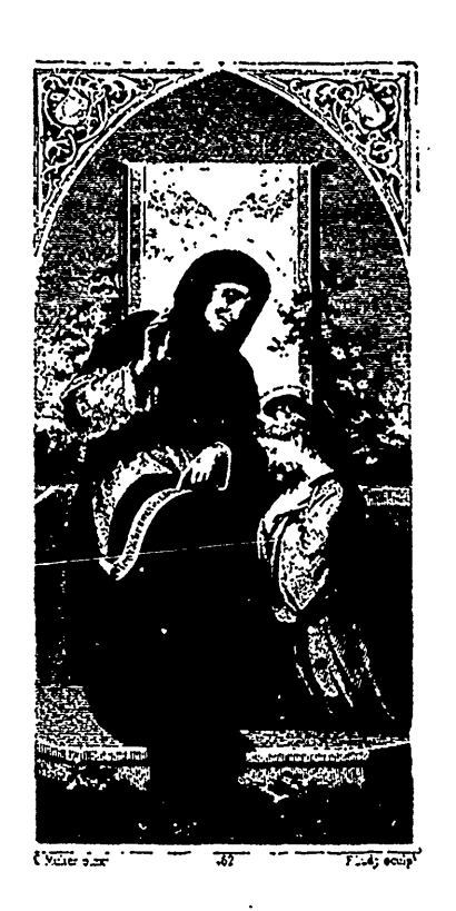
GOOD SAINT ANNE teaching the B. V. Mary