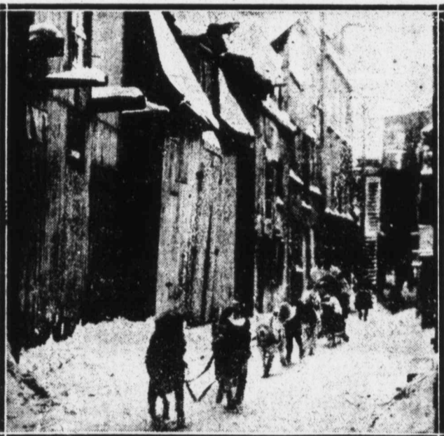
Mush! Mush! Through the streets of Quebec. Even driving through these historic by-ways in the caleshe does not have the charm of a run through them in a husky-drawn carriage. There's a tang in the air and such an atmosphere as could be found nowhere else. Exhilarating and full of color and life. This is the Chateau Frontenac team.