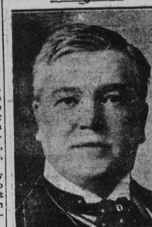
Hon. Rodolphe Lemieux. Prominent Liberal, who, it is announced by the Hon. MacKenzie King, will be elected Speaker of the House of Commons.

A despatch from Paris says: A despatch to the Havas Agency from Cannes says: Premiers Lloyd George and Briand agreed Thursday evening on the conditions for the convocation of an International Economic Conference. The program for the conference, from which politics is to be barred, was settled by them. The despatch adds that it is likely Germany and Russia will be invited to send delegates to the conference, but that participation by Russia will in no way imply recognition of the Soviet Government.