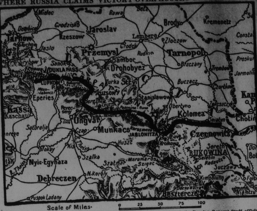
Referring to the battle in the Carpathians as "unprecedented in history," the Russian General Staff officially describes the defeat of the Austro-German forces in the snow covered mountain passes, which the Russians have now gained in spite of twenty-two furious attacks, laying open the plains of Hungary to their further advance. The losses of the Germans were enormous, according to the Russian official report.

WHERE RUSSIA CLAIMS VICTORY OVER AUSTRO-GERMAN FORCES