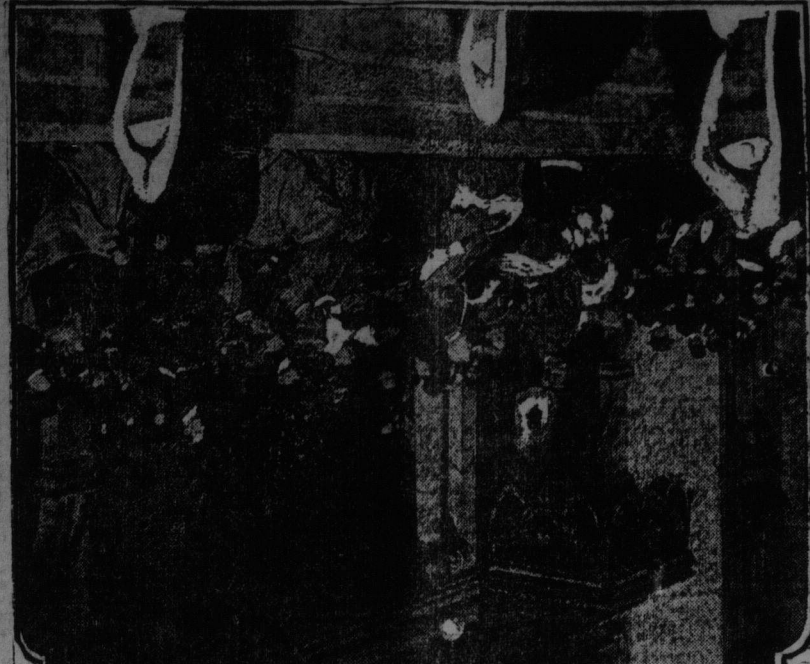
News photograph of the open air mass, one of the chief features of the world's Eucharistic Congress in Montreal—Cardinal Vannutelli, the papal delegate, reviewing the procession of children, led by Sisters of Charity—The congress was perhaps the most remarkable and impressive Catholic event ever held in America—Before dawn on the day of the mass the people began streaming in from all points and by 8.30 a quarter of a million persons had assembled at the foot of Mount Royal, where the mass was celebrated.