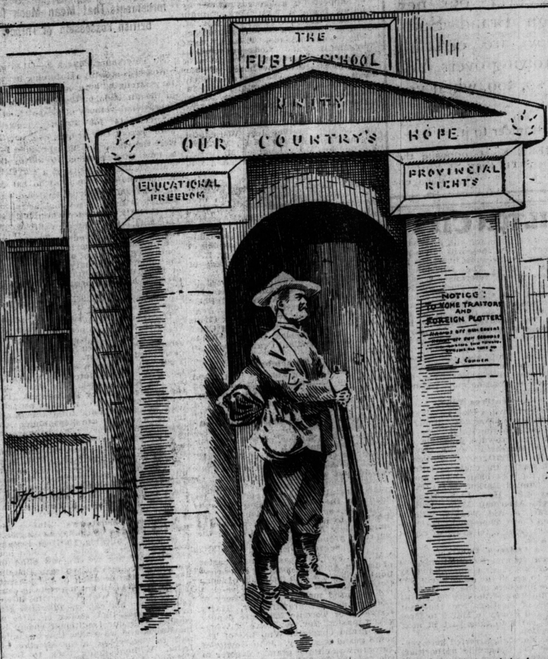
VETERAN JACK CANUCK: I've got to contend with a more subtle and dangerous foe right here at home than poor old Paul Kruger ever was.

Midland, March 9.—(Staff Special)—The special committee of the Grand Lodge, which was appointed at yesterday's session to deal with the question of severing the connection between the Orange Order and the Grand Lodge, met this afternoon.