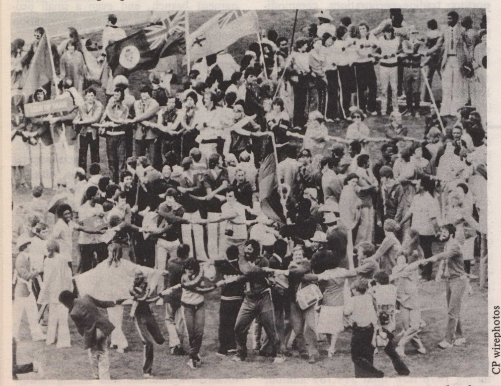
Athletes from various competing countries join hands for Auld Lang Syne at the close of the XI Commonwealth Games in Edmonton, Alberta, on August 12.

Although it was all over, no one wanted to leave. Athletes and entertainers surged back and forth on the track, singing, shouting, dancing, until they finally joined hands to sing Auld Lang Syne time and time again. "See you in 1982 in Brisbane", read the big electronic scoreboard; so ended the 1978 Edmonton Commonwealth Games.