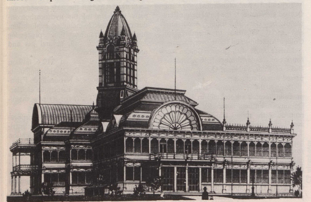
A model of Toronto's original Crystal Palace is on display on the CNE grounds.

The model, large for a miniature, measures 2.85 metres long by 1.425 metres wide by 1.5 metres high.