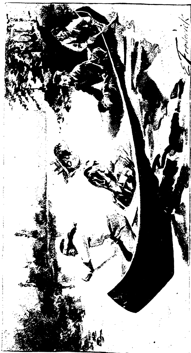
THE SILENCE WAS BROKEN ONLY BY THE REGULAR DIP OF THE PADDLE. 1 —Page 47.