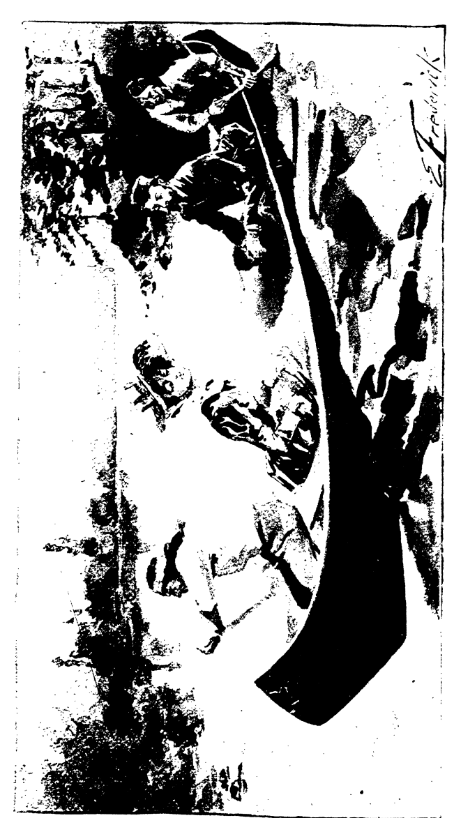
"THE SILENCE WAS BROKEN ONLY BY THE REGULAR DIP OF THE PADDLE."—Page 47.