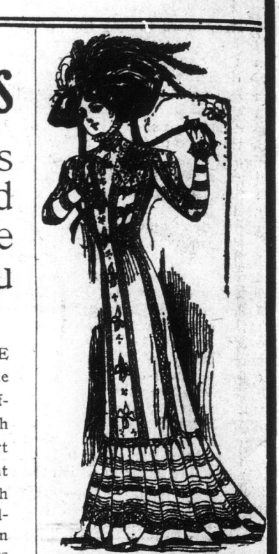
Princess Dress, $25.00

WOMEN'S HAND-COSTUME, in ecru net. Yoke and front formed of rows of insertion and tucks, full length tucked sleeve. Skirt with deep flounce of tucks and lace. Lined throughout with silk. Price ... .. $25.00