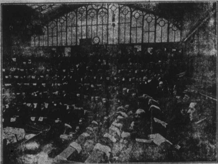
The above is a reproduction of a commercial sales room in Manchester England with the buyers all in seats and catalogs is open ready for sale to begin.