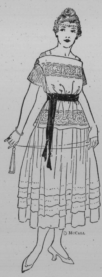
One of the New Bordered Voiles.

Quite as interesting, at the opening of a season, as the new designs themselves and a thousand and one odd little fads which Fashion always presents at her openings, are the new materials in which to fashion these quaint precise, art nouveau figures.