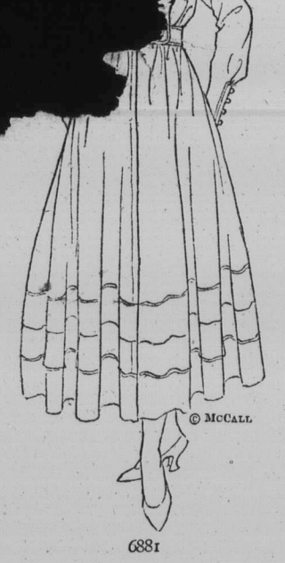
Rose Linen With White Vest.

bakepan that has been previously wet with cold water; use knife or back of spoon to smooth in places, when cold turn out, cut in thick slices, dip in flour and brown in hot pan. The Novelty Cottons. The Novelty Cottons. In those distant regions the would come as near as he would turn out the true God. There is no paucity of novelties in pages he would come as near as he of the new spring and summer cottons; could to the true God. 28. Reading—Aloud, as the word ing and design. Voil 3 forms the basis usually implies. Since Greek MSS.