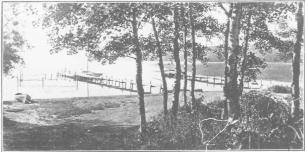
Lake Ninette, in "The Good Old Summer Time."