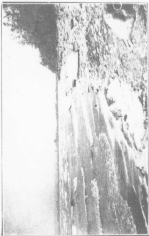
Where the Big Quill Washes on a Sandy Shore.