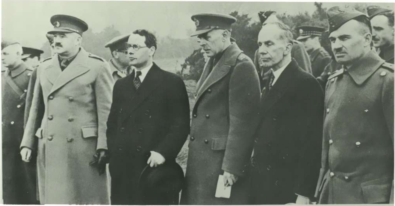
Malcolm MacDonald visitant les troupes canadiennes en Grande-Bretagne, en 1941, avant d'assumer le poste de haut-commissaire au Canada. Au centre en partant de g.: MacDonald, le lieutenant-général A. G. L. McNaughton, Vincent Massey.