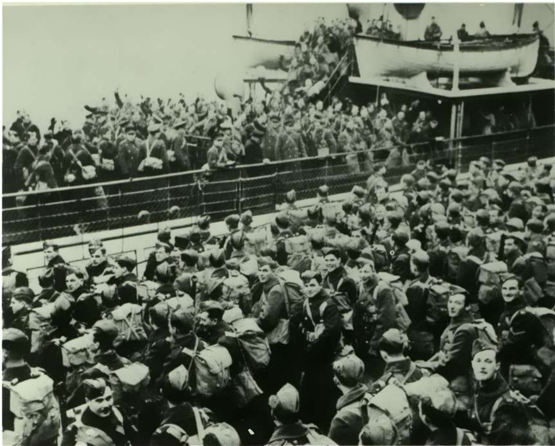
Arrivée de la première Division canadienne en Grande-Bretagne, décembre 1939.