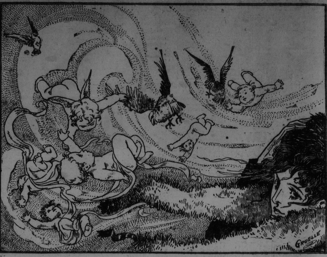
"STORMY MARCH HAS COME AT LAST, WITH WIND AND CLOUD CHANGING SKIES."