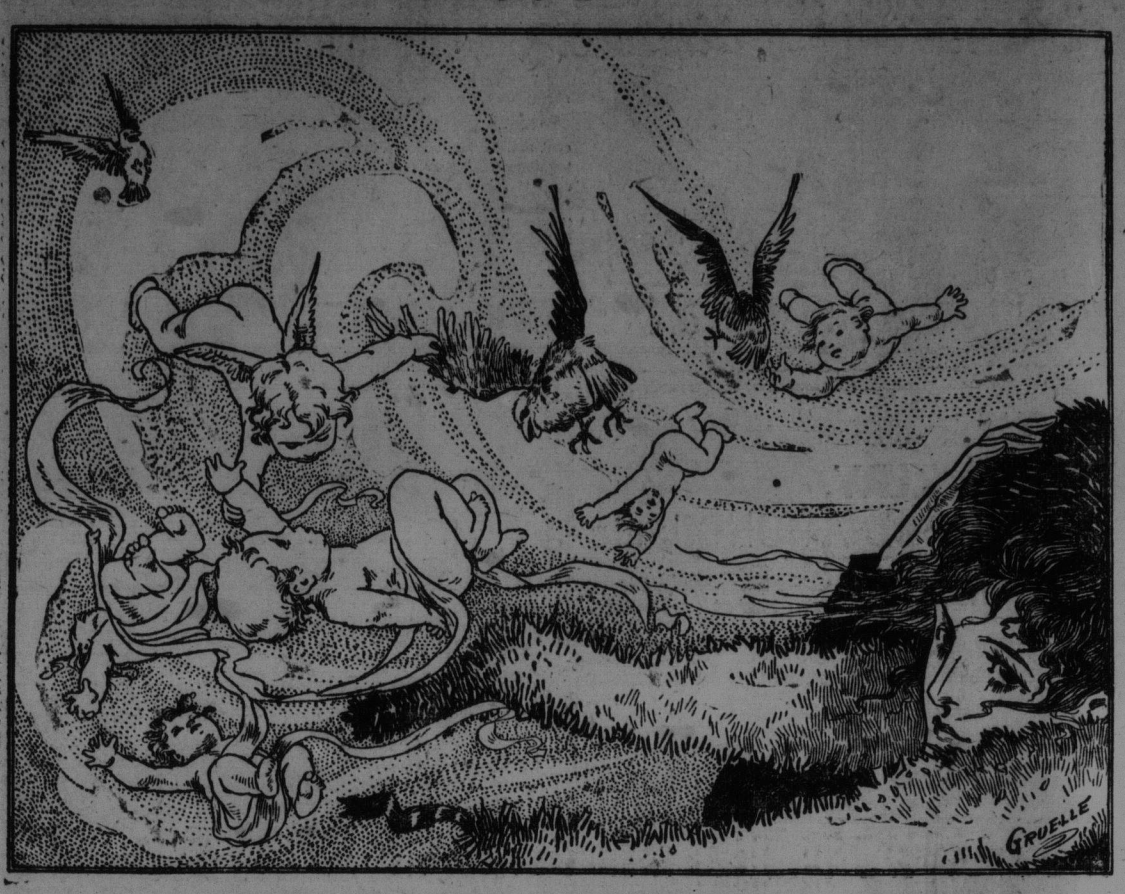
"STORMY MARCH HAS COME AT LAST, WITH WIND AND CLOUD CHANGING SKIES