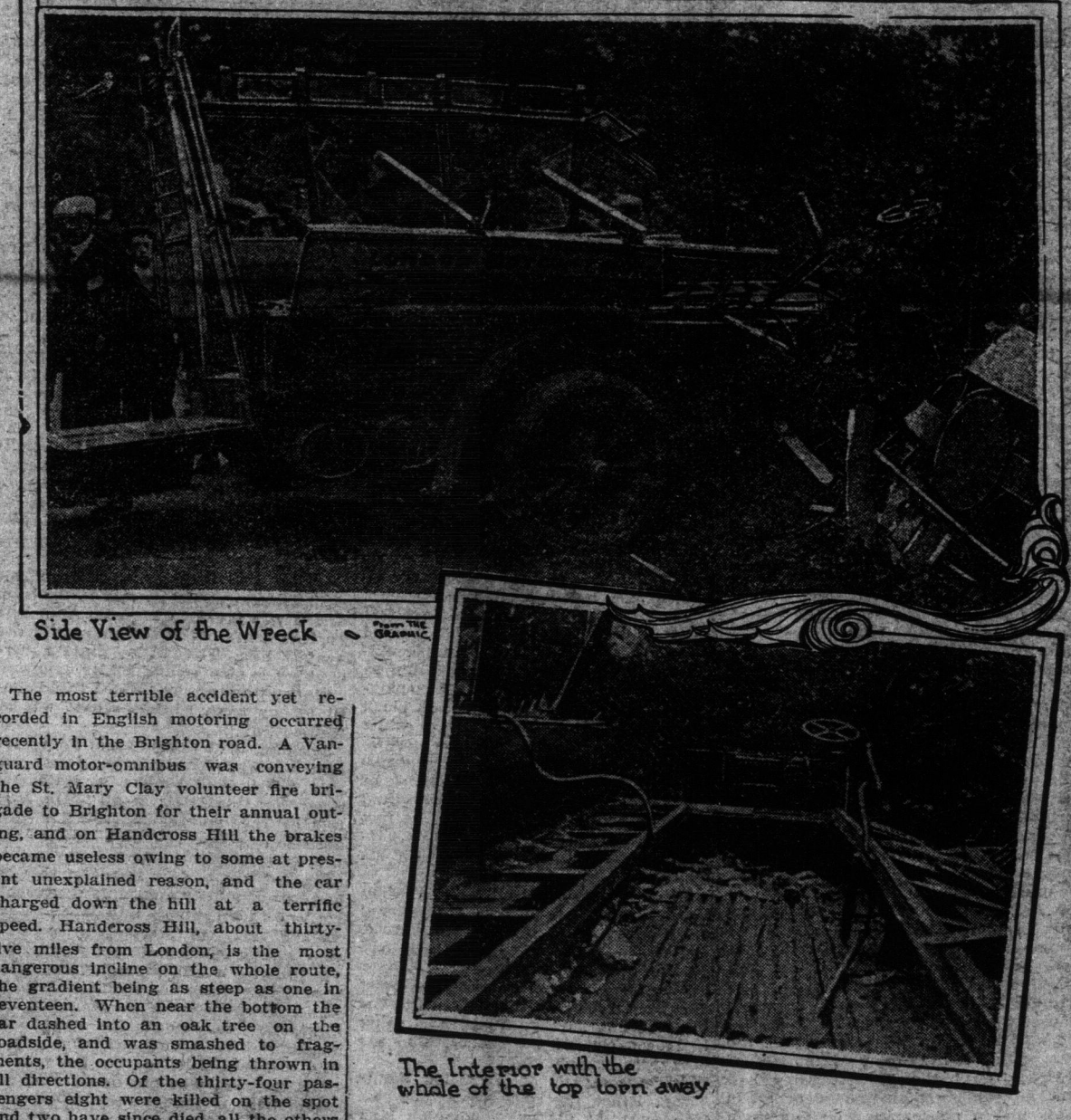
Side View of the Wreck and The Interior with the whole of the top torn away